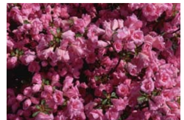
Azalea Show coming to Jewel Box in February. Stock Photo

almost ready to be placed in the Jewel Box. The Easter lilies are green and growing right on schedule in the greenhouse and will be ready of the Easter season.