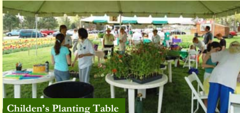
Children's Planting Table