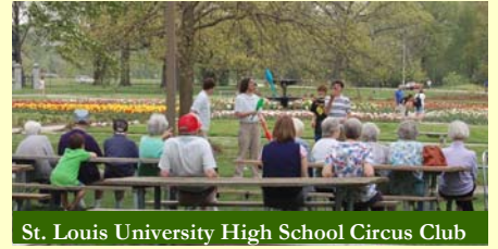
St. Louis University High School Circus Club