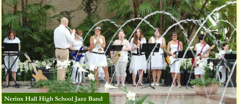
Nerinx Hall High School Jazz Band